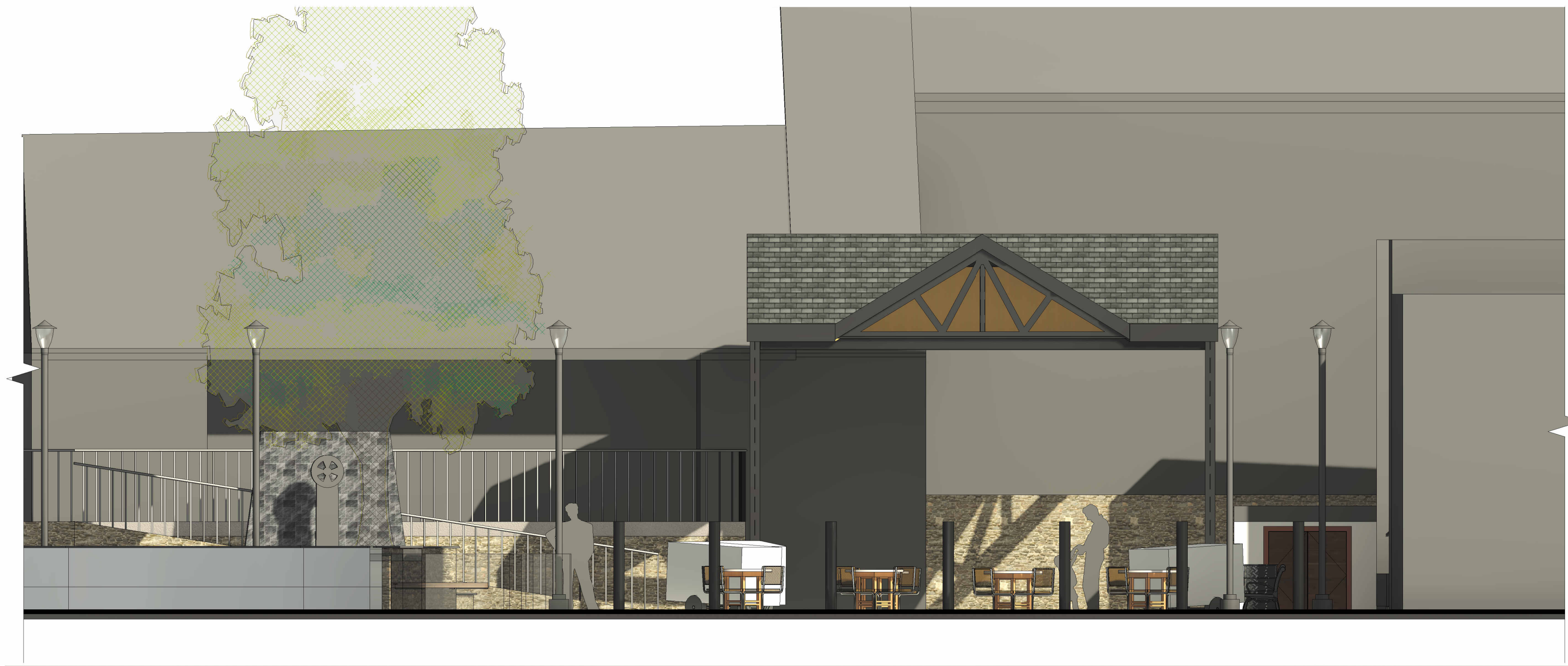
Proposed East Elevation 1:30

Party Wall - Works come under the Party Wall Etc. Act 1996. All appropriate notices and awards should be issued prior to work taking place.